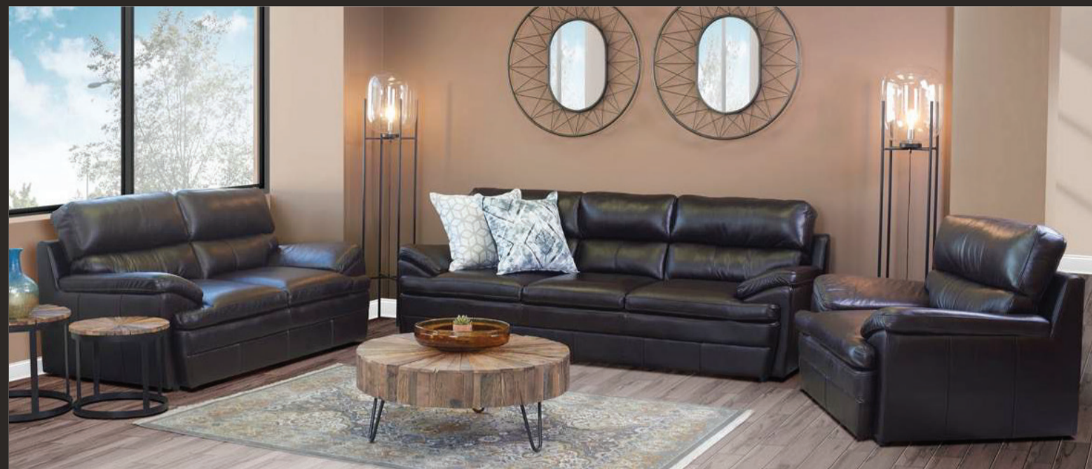
CAMBRIDGE 3 PIECE LOUNGE SUITE BLACK OR CREAM