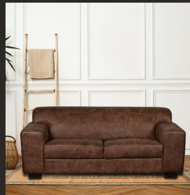
KAMPALA 3 DIVISION COUCH BROWN

N$ 66 449 N$ 3 301 PM x 24 months 10% deposit