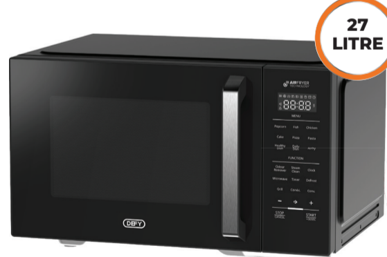
AIRFRYER MICROWAVE OVEN DMO 500

N$ 2 019 N$ 130 PM x 24 months 10% deposit