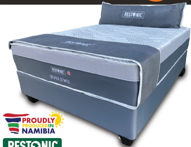
SILVER JEWEL QUEEN | 152CM STANDARD LENGTH | 188CM

N$ 18 349 N$ 968 PM x 24 months 10% deposit