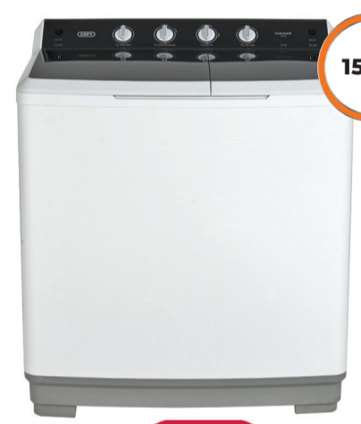
TWIN TUB DTT151

N$ 6 679 N$ 384 PM x 24 months 10% deposit