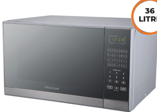
MICROWAVE OVEN H36MOMMI

N$ 6 459 N$ 373 PM x 24 months 10% deposit